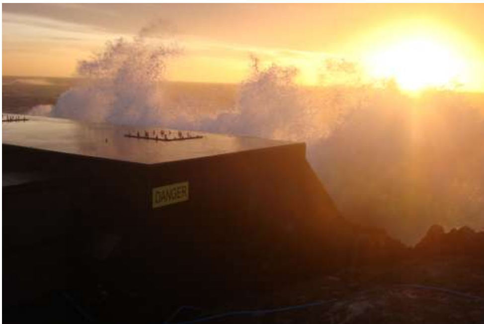
Limpet device on Islay

Large scale deployment of marine energy technology in Scottish waters by 2020 is possible, but requires fast and concerted action by all players, coupled with a strong leadership role for the public sector.