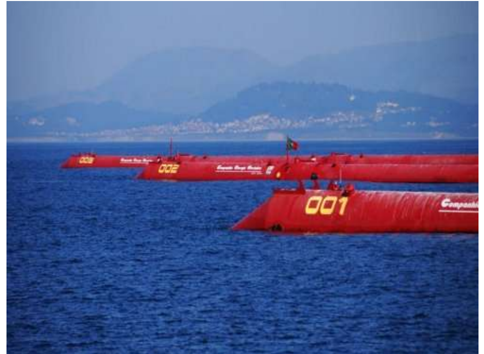
P 1-A Pelamis machines at Aqucadoura

In contrast, this document sets out scenarios demonstrating a range of possible deployment pathways, as set out in the graph and table below. The illustrative curves show illustrative overall deployment levels, starting with lower moving to more aspirational ambitions, progressing through the 3 scenarios. Achieving any of these illustrative scenarios will depend on tackling a number of variables which are addressed in greater detail elsewhere within this document.