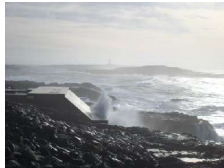
Limpet device on Islay