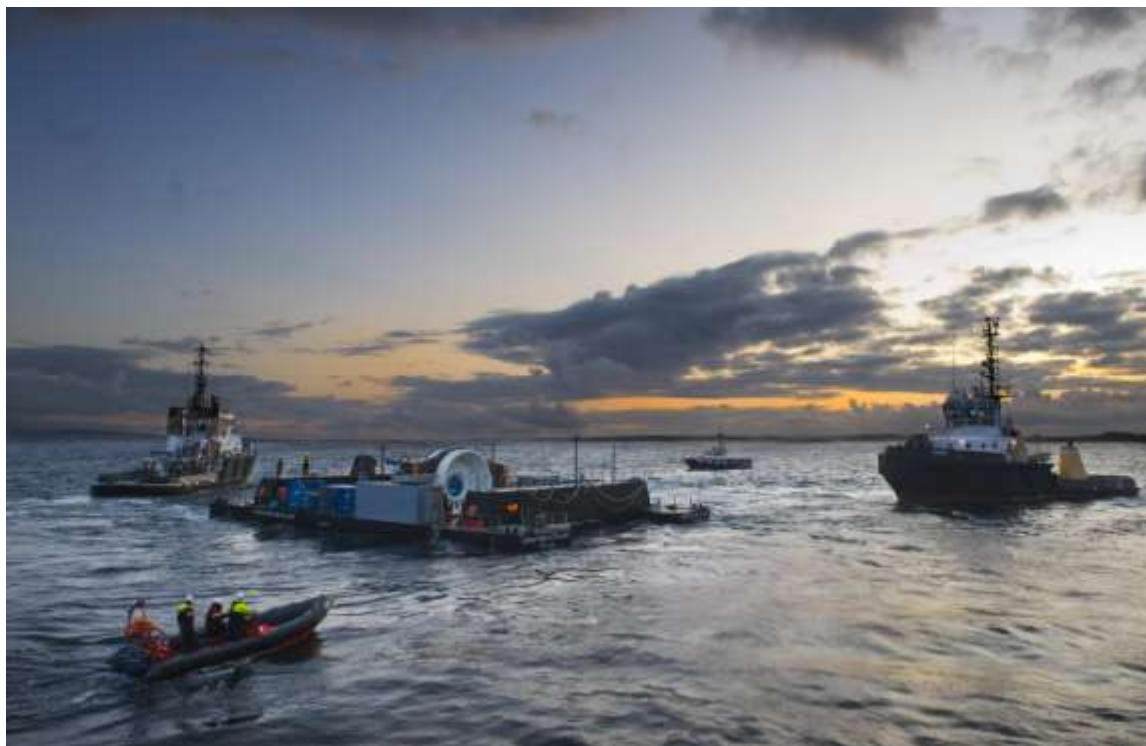
OpenHydro device at EMEC tidal test site

MEG recognises that the growth of the marine renewables industry, accompanied with the growth of offshore wind, will lead to significant new infrastructure and supply chain demands in Scotland. Key areas of new demand will include device manufacturing, enabling infrastructure, installation/decommissioning engineering services and operation/maintenance services. Coupled with the growth of the offshore renewables industry more widely across the UK and Europe, MEG believes strongly that Scotland has the opportunity now to secure itself as a leader in the development, manufacturing and installation of offshore renewable projects – bringing significant benefits to Scotland’s economy and creating new skilled jobs.