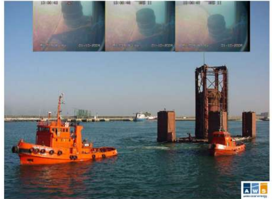
AWS prototype deployment

Capitalising on Scotland's natural advantage when it comes to marine energy will depend on building the transmission and distribution infrastructure needed to connect at remote locations. National Grid and Scottish Hydro-Electric Transmission Ltd (SNET – responsible for building and maintaining the north Scotland transmission network) have advised MEG that they could build the infrastructure required to grid connect marine energy projects in line with project development goals if they receive underwritten applications for grid-connecting viable projects on time.