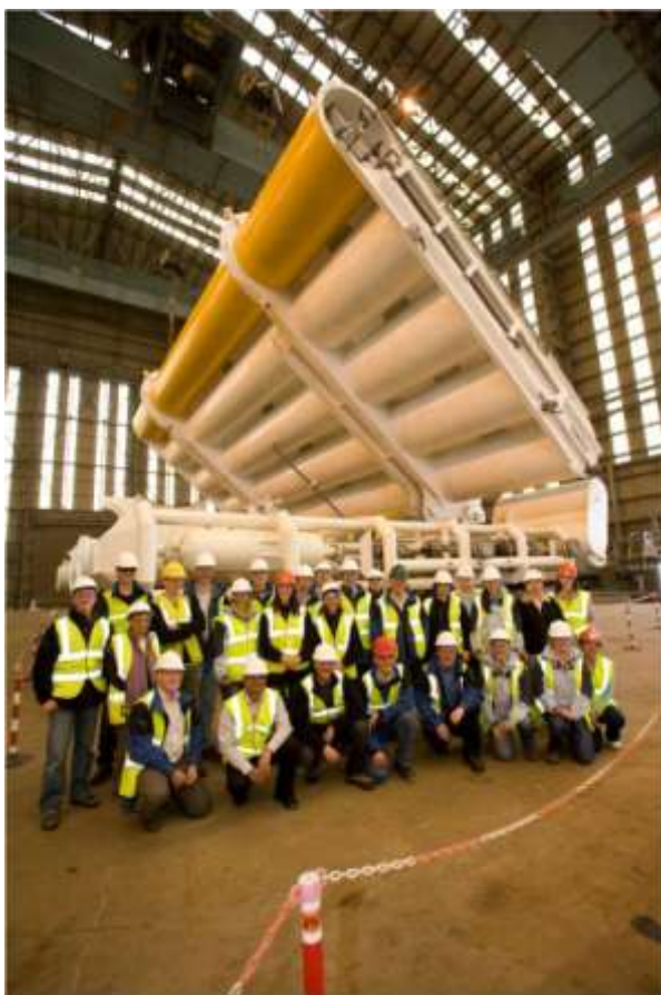
Oyster device © Aquamarine Power Ltd

MEG established a Finance Sub-Group, with strong input from technology developers, to analyse financial barriers to marine energy market development and propose actions to tackle these barriers.