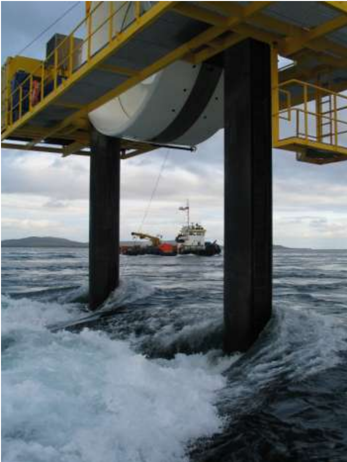
OpenHydro device at EMEC

MEG convened a Planning Sub-Group to develop key recommendations on the planning and consents systems governing marine energy developments in Scotland. MEG believes that the quality and efficiency of Scotland's onshore and offshore licensing and consents system will be critical to developing a successful marine energy industry.